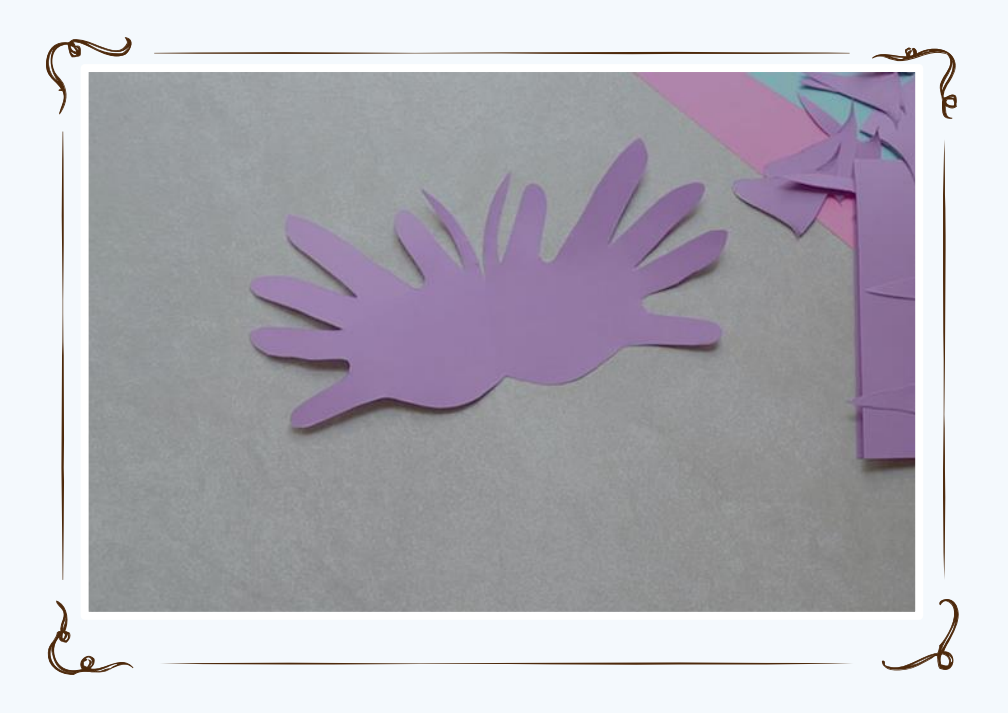
Now you have two hands joined together

Trace your hand on the paper as seen in the picture