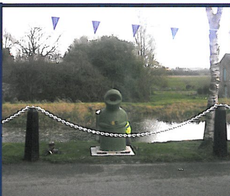
Who is hiding behind the frog????